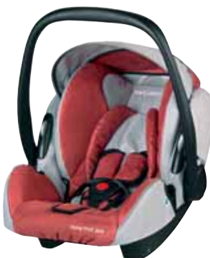
Trendline Bellini „Red/Silver“ 5514.21092.66