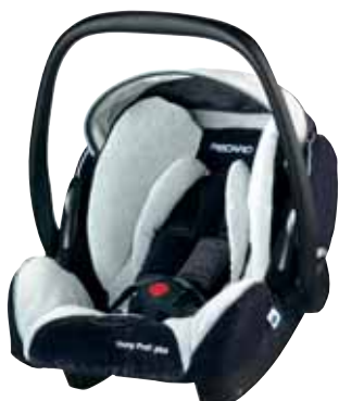
Topline Microfibre „Black/Silver“ 5514.21086.66