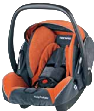
Topline Microfibre „Grey/Pepper“ 5514.21107.66