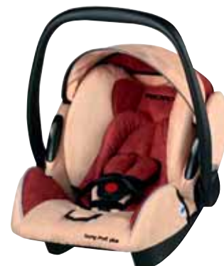
Trendline Bellini „Ruby/Cream“ 5514.21133.66