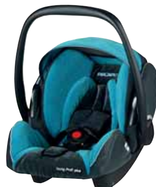
Topline Microfibre „Grey/Petrol“ 5514.21137.66