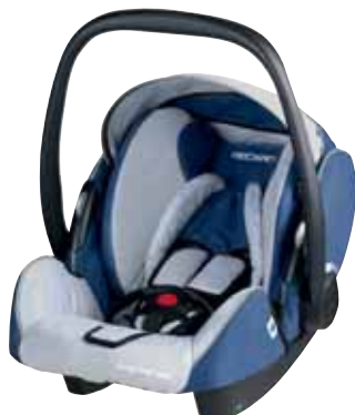
Trendline Bellini „Steel/Blue“ 5514.21113.66