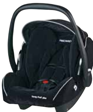
Topline Microfibre „Black/Aquavit“ 5514.21109.66