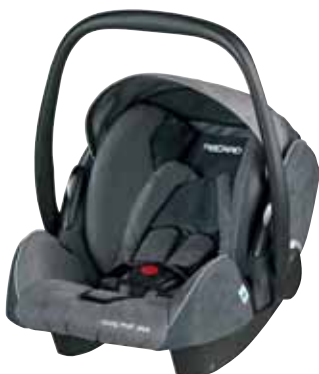
Trendline Bellini „Asphalt/Grey“ 5514.21112.66